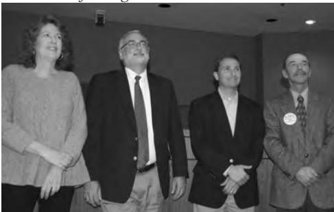
County Supervisors - School Board