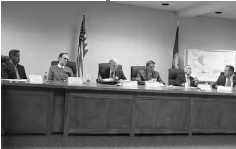
Christiansburg Town Council