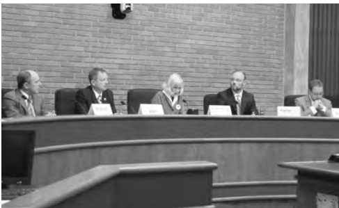
House of Delegates - 7th and 12th districts