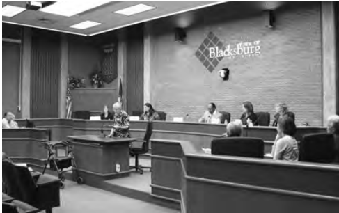
Blacksburg Town Council

P.O. Box 10133, Blacksburg, VA 24062-0133 http://www.lwvmcva.org